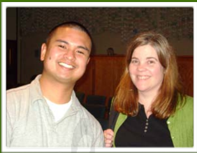
Meet our Staff:

There is a follow-up meeting with the student's parents to review the expectations and responsibilities as a SSYC member. The director will then determine which choir appropriately fits their ability.